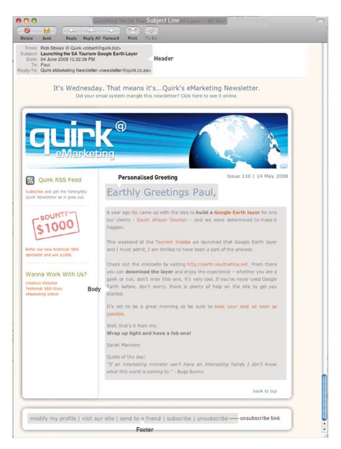
HTML email with mentioned elements shown

Email content that is relevant and something that readers will value, is vital to ensuring the success of an email marketing campaign. Valuable content is informative and should address the problems and needs of readers. It is important to realise that the reader determines the value of the content, not the publisher.